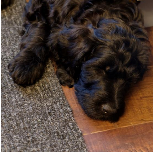
light from above and behind through a window; blue highlights in the fur are reflected light