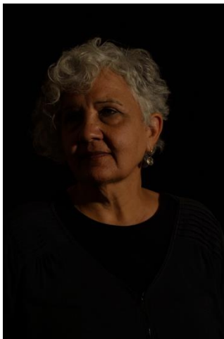
use of shadow to create mood