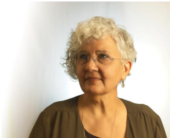
yellow light, note effect on skin and hair, 2 lights used