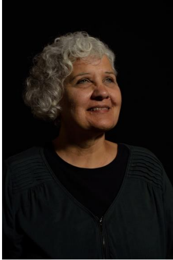
one light diffused through fabric