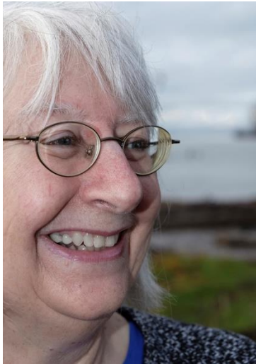
soft light, overcast day with fill flash, blue light