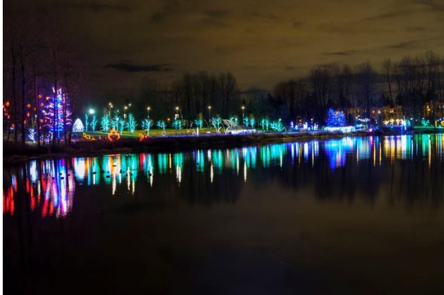
three light sources, sky, xmas lights, reflections