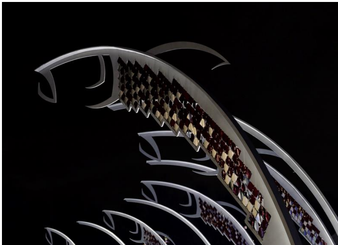
lit mostly from above, highlight on the edge creates dimension