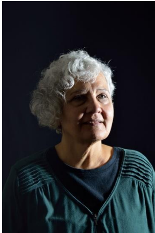
same light, subject turned away a bit, and no fabric